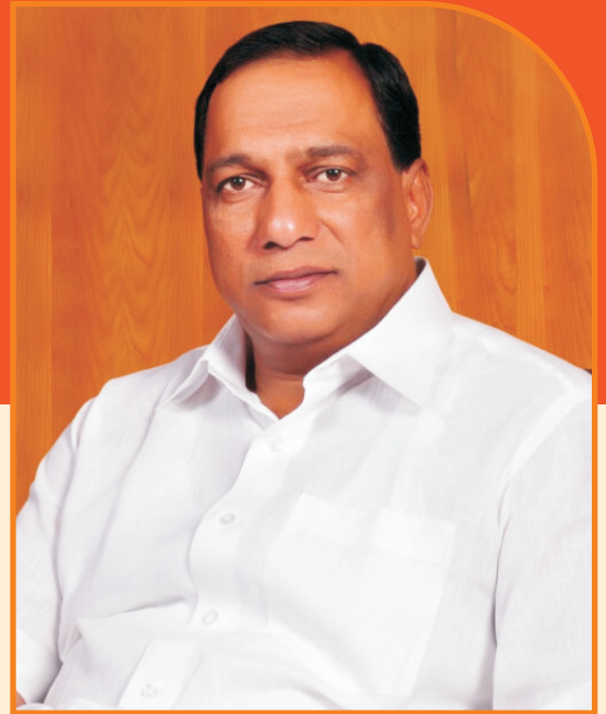
SRI CH. MALLA REDDY Founder Chairman, MRGI

Sri. Ch. Malla Reddy is an educationist and a politician of highest repute. He is currently serving as the Hon'ble Minister for Labor and Employment, Factories, and Skill Development, Govt. of Telangana State. His dream is to bring out quality Engineers who would contribute the progress of the nation. He firmly believes in Skills development for students. He wants the young minds to be nurtured in grasping emerging technologies. He believes that they need to have the skills and attitudes that are relevant to the future work demands. He urges the faculty to focus on holistic teaching-learning process so as to pave way to quality output and future leaders of our nation striving towards Excellence in the truest sense.